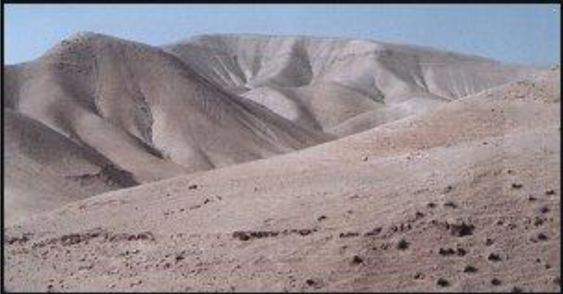
The Barren Wilderness of Judea Less than two inches of rain fall here each year.